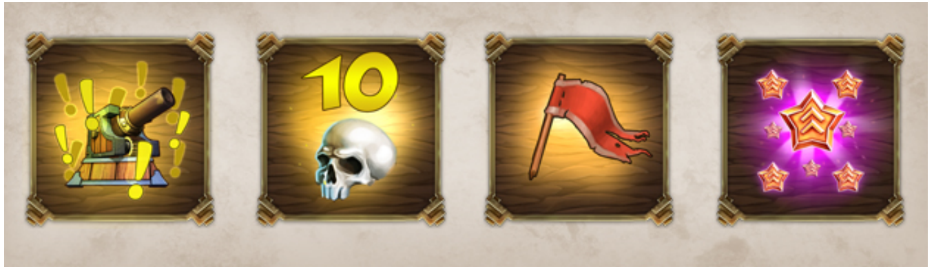
• Four new achievements. Unique quests made specially for the new episodes. Challenge yourself with exciting trials!