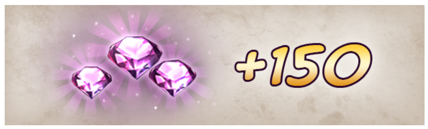
• The DLC also contains 150 free crystals for store upgrades. You can spend them however you like, since you don't need them to complete the game.

Please leave your comments and suggestions for improving the game and the genre!