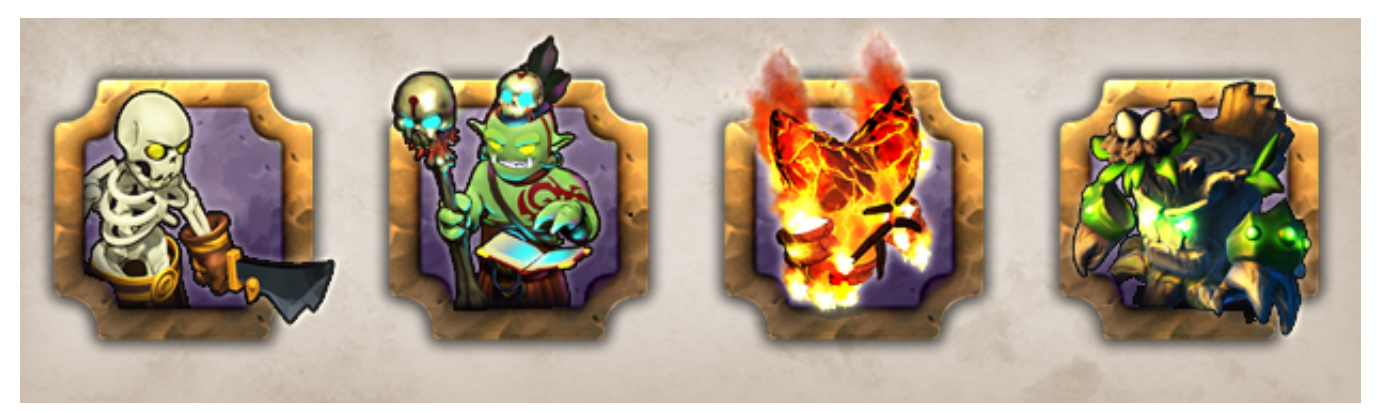
• Four new units, each with its own unique abilities. Skeleton, Necromancer, Fire Elemental, Nature Elemental.